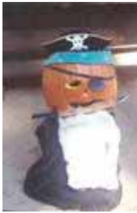
Last years winning pumpkin